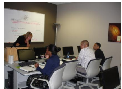
Applicants getting advice on targeting their resumes.